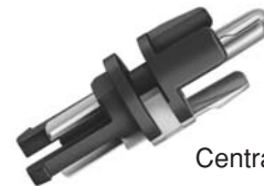
Central Contact Unit

But your nextgen plug WBT-0110 makes it even more comfortable: By pressing the two snap hooks left and right you have the possibility to pull out the whole Central Contact Unit by the front. This way you may solder the plus and the minus outside the connector's body.